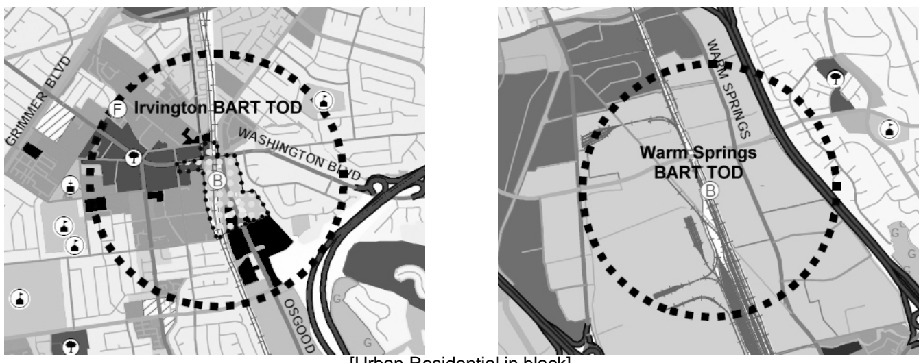
[Urban Residential in black]

The development in this area is defined by the Warm Springs/South Fremont Master Plan. It is a mixture of Industrial, Commercial, Medium and Urban Residential sections. It is the only TOD area in Fremont with a Master Plan.